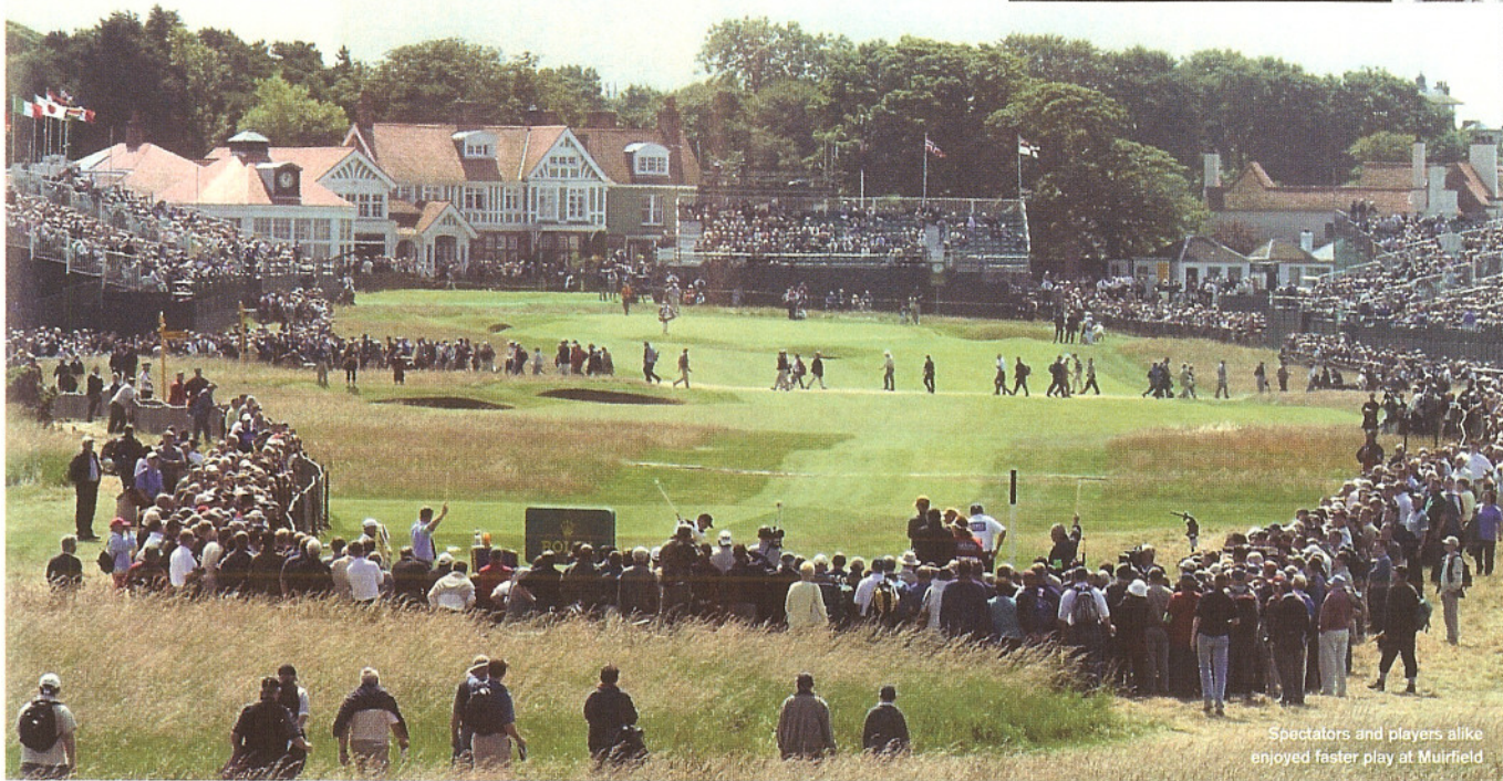
Spectators and players alike enjoyed faster play at Muirfield